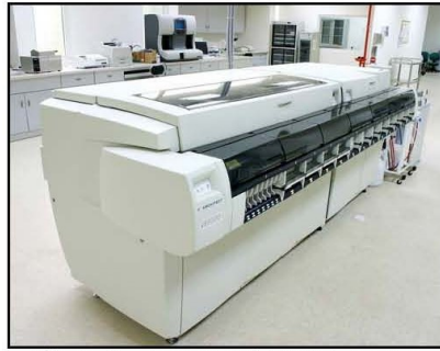
Figure 5 - Automated ELISA system

One option that may be available to the Company in the future is to license our NuQ™ technology on a non-exclusive basis to a global diagnostics company. As of the date of this Amended Registration Statement, the Company has not entered into any discussions or negotiations with diagnostic companies or established an anticipated timeframe for licensing our NuQ™ technology.