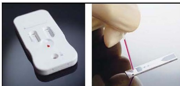
Figure 7 – Examples of disposable doctor's office or home use tests

The above photograph is an illustration of the Company's intended products. To date, the Company has no products available for sale on the IVD or RUO market and there is no guarantee that any such products will be developed or commercialized on either market.