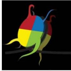
Figure 1 – A nucleosome

Cancer is characterized by uncontrolled and rapid cell growth and also by an approximately matched, but slightly less, rapid cell death rate. When the cells die, the DNA is chopped up into individual nucleosomes which are released into the blood as summarized in Figure 1 below. When cells break up, they end up in the bloodstream to be recycled back into the body. When a cancer is present, the number of cells being recycled is far higher than in a healthy body, so the system is overwhelmed, leaving the excess broken-up pieces, including the nucleosomes, in the blood. The structure of nucleosomes is not uniform but subject to immense variety. It has been known for 4 or 5 years that nucleosomes in cancer cells are different in structure from those in healthy cells 7 .