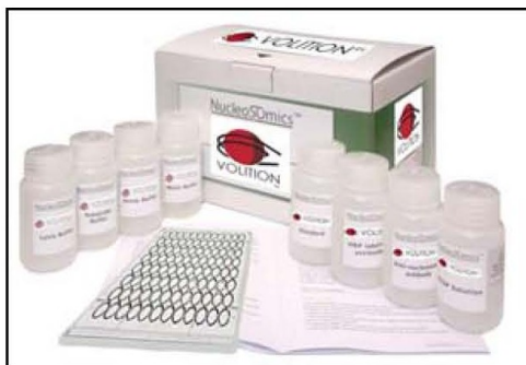
Figure 3 – Example of Intended Product

A mock-up of a typical kit is shown in Figure 3 below.