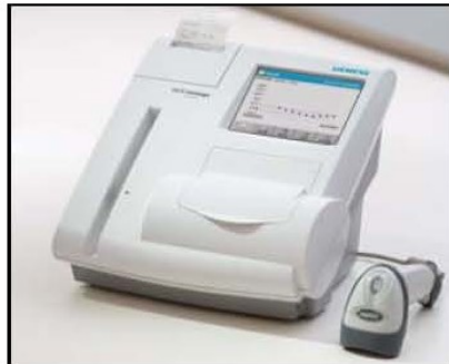
Figure 6 – Example of a point-of-care device

The above photograph is an illustration of the Company's intended products. To date, the Company has no products available for sale on the IVD or RUO market and there is no guarantee that any such products will be developed or commercialized on either market.