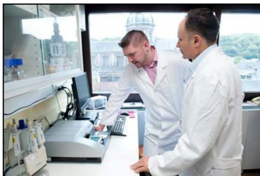
Figure 4 – Example of lab instrument for running ELISA tests

The NuQ™ research use kits will be designed to run on simple instrumentation available from a wide range of suppliers and found in most research laboratories and hospitals. Our own instrument, on which we develop and run the NuQ™ tests is shown in Figure 4 below.