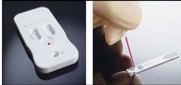
Figure 6 – Examples of Disposable Doctor's Office or Home Use Tests

The above photograph is an illustration of our intended products. To date, we have no products available for sale on the IVD market and there is no guarantee that any such products will be developed or commercialized on such market.