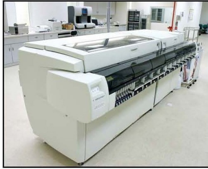
Figure 4 – Example of an Automated ELISA System

One option that may be available to us in the future is to license our Nucleosomics ® technology to a global diagnostics company. As of the date of this prospectus, we do not have an anticipated timeframe for licensing our Nucleosomics ® technology.