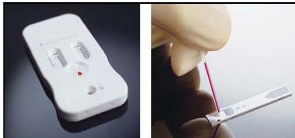
Figure 6 – Examples of Disposable Doctor's Office or Home Use Tests

The above photograph is an illustration of our intended products. To date, we have no products available for sale on the IVD market and there is no guarantee that any such products will be developed or commercialized on such market.