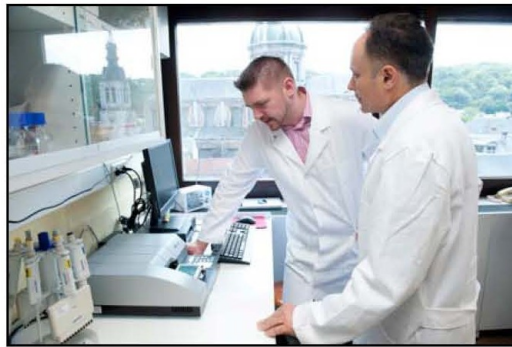
Figure 3 – Example of lab instrument for running ELISA tests

The NuQ ® research use kits are designed to run on simple instrumentation available from a wide range of suppliers and found in most research laboratories and hospitals. Our own instrument, on which we develop and run the NuQ ® tests is shown in Figure 3 below.