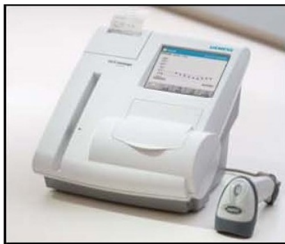
Figure 5 – Example of a Point-of-Care Device

The above photograph is an illustration of our intended products. To date, we have no products available for sale on the IVD market and there is no guarantee that any such products will be developed or commercialized on such market.