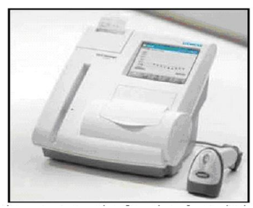
Figure 5 – Example of a Point-of-Care Device

• <u>Point-of-Care Devices</u>: Point-of-care devices are small instruments that perform tens of ELISA tests per day rapidly on blood taken from a finger prick. The instruments can be found in any oncology clinic and tests can be performed during patient consultations. The Company intends to contract with an instrument manufacturer to produce these instruments for point-of-care NuQ<sup>®</sup> testing for the oncologist's office, general doctor's office or at home testing. The Company hopes to enter the point-of-care clinical market in Europe in 2016 and in the U.S. in 2017, as the Company will first need to adapt its test prototypes to these small instruments and demonstrate their success in the greater diagnostics market before these products will be adopted by others in the industry. At this stage of its development, the Company has not entered into any discussions or negotiations regarding the manufacture or sale of these devices. See Figure 5 for an example of a point-of-care device.