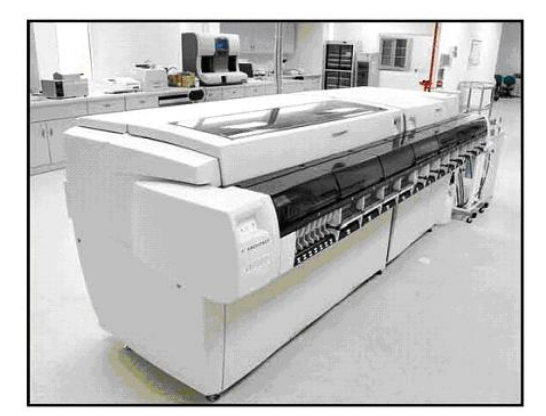
Figure 4 – Example of an Automated ELISA System