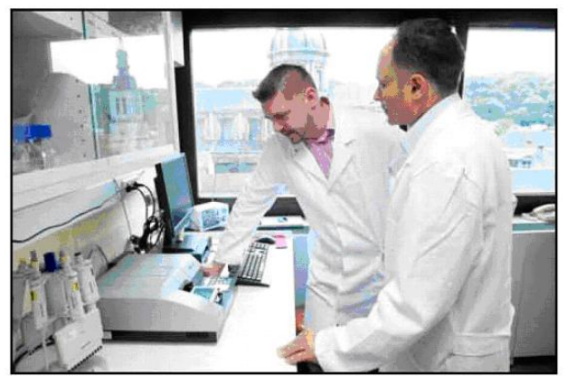
Figure 3 – Example of lab instrument for running ELISA tests

The NuQ<sup>®</sup> research use kits are designed to run on simple instrumentation available from a wide range of suppliers and found in most research laboratories and hospitals. Our own instrument, on which we develop and run the NuQ<sup>®</sup> tests is shown in Figure 3 below.