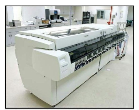
Figure 4 – Example of an Automated ELISA System

One option that may be available to us in the future is to license our Nucleosomics<sup>®</sup> technology to a global diagnostics company. Another option that may be available to us is to sell manual and/or semi-automated 96 well ELISA plates for use by these laboratories. We do not have an anticipated timeframe for licensing our Nucleosomics<sup>®</sup> technology or selling ELISA plates to laboratories, although we are actively seeking such relationships worldwide.