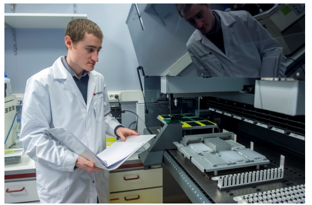
Figure 3 - Example of lab instrument for running ELISA tests